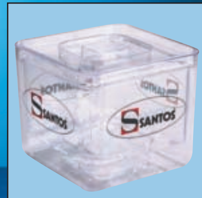
N° 53 Gris